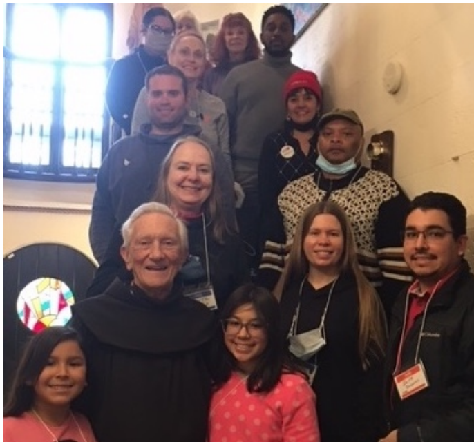
Silva Graduates, Winter 2022